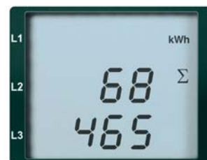
Real energy consumption